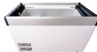
Inner LED Lamp Available