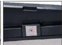
Temperature Display Available